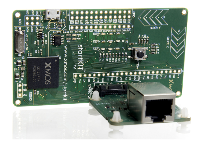
Figure 1: startKIT with Ethernet sliceCARD

XMOS already has a set of sliceCARDs that you can buy. Alternatively it is easy to design your own slices to extend the platform as the PCle connectors are simply contacts to the sliceCARD.