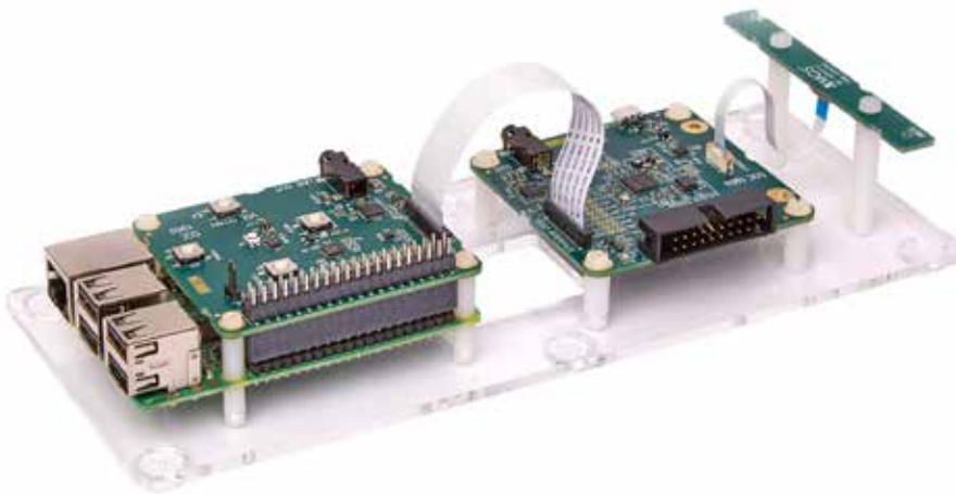
VocalFusion Dev Kit for Amazon AVS (Raspberry Pi not included)

The VocalFusion Dev Kit for Amazon AVS (XK-VF3510-L71-AVS) enables developers of smart home products to evaluate and prototype far-field voice interfaces using the XVF3510 voice processor with the Amazon Alexa Voice Service.