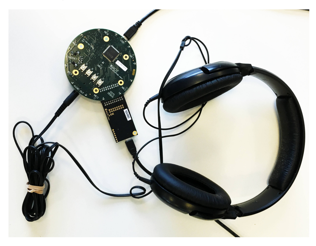
Figure 2: Hardware setup

To run the demo, connect a USB cable to power the Microphone Array Ref Design v1 and plug the xTAG to the board and connect the xTAG USB cable to your development machine. You will also need to connect headphones to the audio jack.